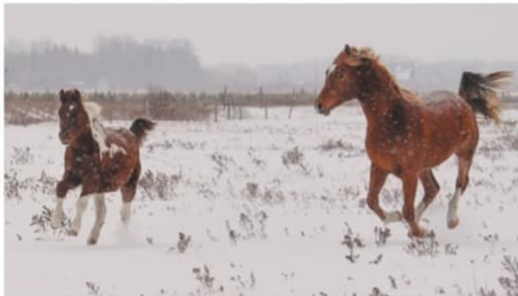
Paisley is quite a bit bigger and not always the best of friends but Peeka adores her.

As the foal was being born I was ecstatic when I saw the two-toned mane and minimal white. I had wanted a bay like Gift but this foal was chestnut. That momentary disappointment was quickly forgotten as here was the cutest little package of joy! The icing on the cake,