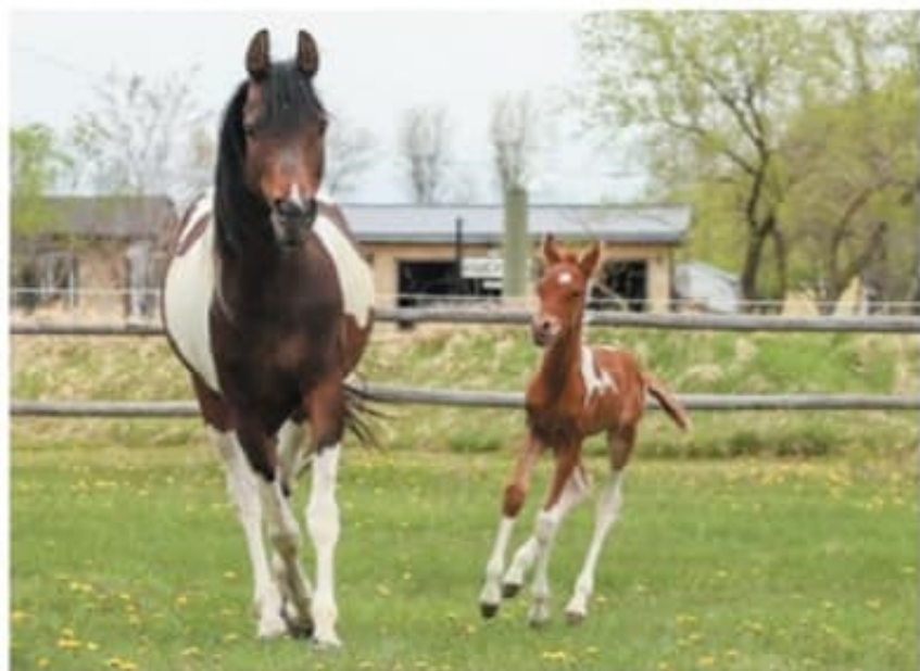
Two-day-old PRAIRIE WINDS PEEKABOO, aka Peeka , by RF Mortdecai out of Gift.

though and had gas colic several times during her pregnancy. I think she was protesting her trip to Canada! Thankfully I knew exactly how to treat her and each time she would perk up and all would be well again. I was sure it was stress, and the fact that my herd scared the spots off her didn't help! Gift started spending her nights in the barn where she could still see the others but could relax and eat unmolested by the riffraff. She was quite happy with this idea, but still would have the odd gas colic just to freak me out.