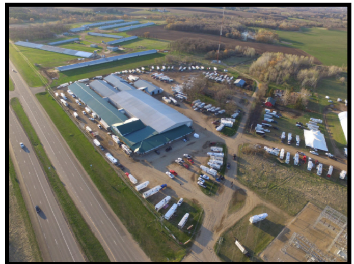
R & J Arena at Verndale, MN

On Sunday Amanda Schwandt Photography will be available for pictures aschwandtphotography@yahoo.com